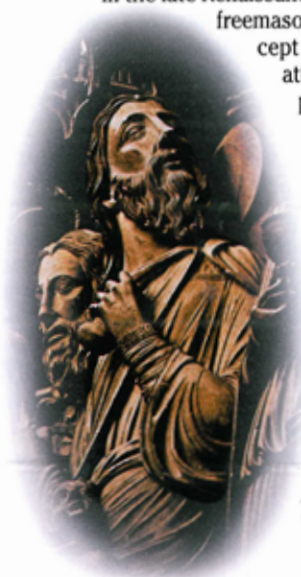
Abraham portrayed as a stone mason at the Cathedral of Chartres, 12th Century.