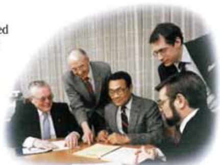
Shown here with the superintendent of a major public school system, Masons regularly work with community leaders.

Race day at the Shriners Hospital for Crippled Children.