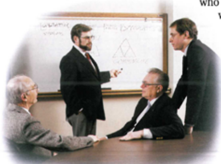
Masonic work can develop career and personal leadership skills in project and business management.

Two progressive paths from Blue Lodge offer unique ritual instruction. Many Masons advance through both; many are "Blue Lodge Masons" only. Other groups affiliated with these bodies are not shown.