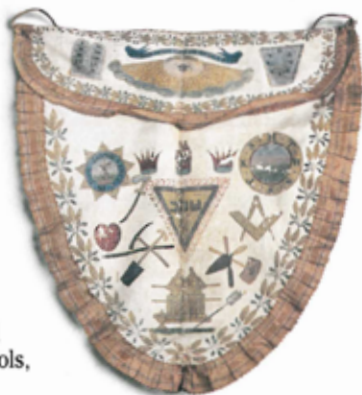
An ancient Masonic apron, probably English.

The first Lodge in the Colonies was chartered in Boston in 1733, and the first Lodge in Oregon at Oregon City in 1846.